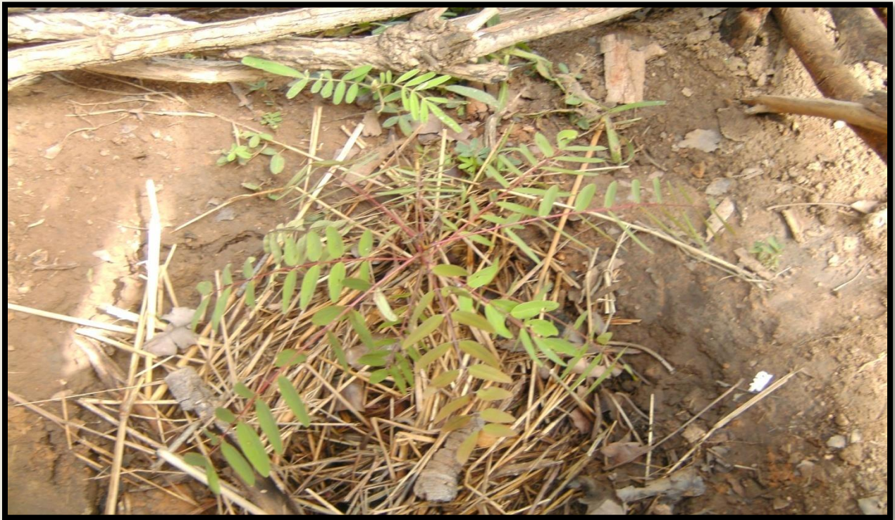
A planted acacia tree in view at Berinyase JHS after three weeks