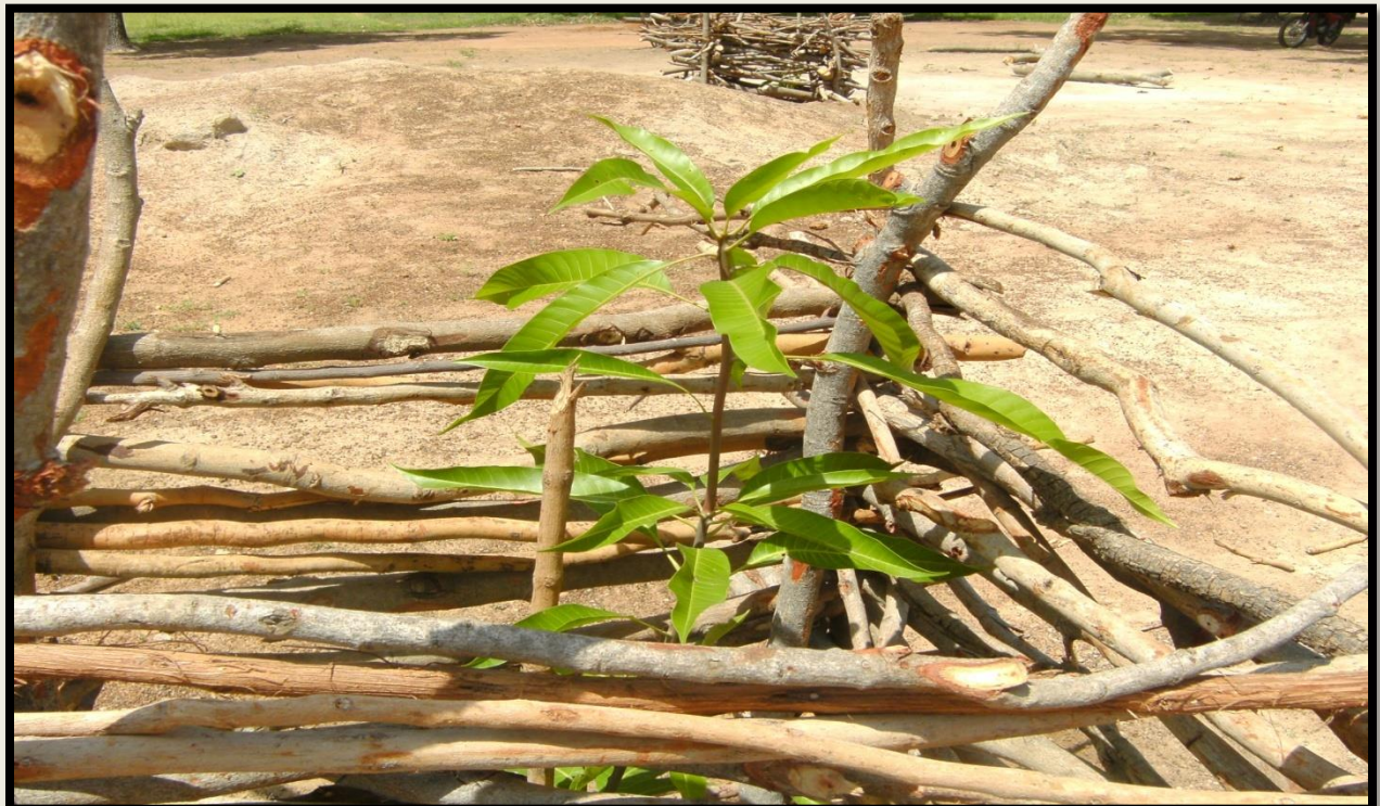
Below is a picture of a mango tree planted at Berinyase JHS after three weeks